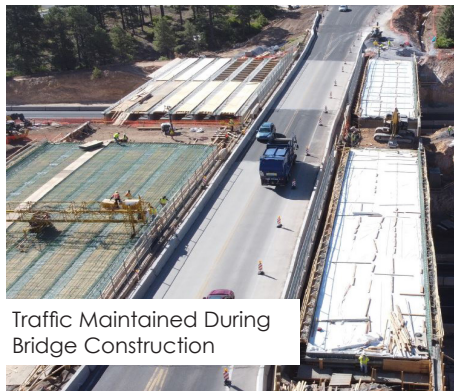
Traffic Maintained During Bridge Construction

ADOT awarded this contract to FNF using the design-bid-build procurement method. Work consisted of widening and replacing the existing bridges at the 4th Street Underpass using the slide method of construction and rehabilitation of the existing bridge decks at the Butler Avenue Overpass. The project was allowed 17 days for a full closure of 4th Street to demo two existing bridges, slide two bridges into place, reconstruct the roadway and open traffic. FNF worked 24/7, with 18 separate crews, and used only 15 of the 17-day closure.