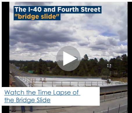
The I-40 and Fourth Street "bridge slide"